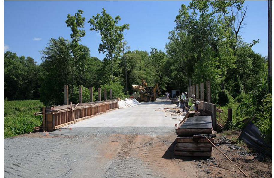
Brooke Road, Bridge Replacement at Potomac Creek