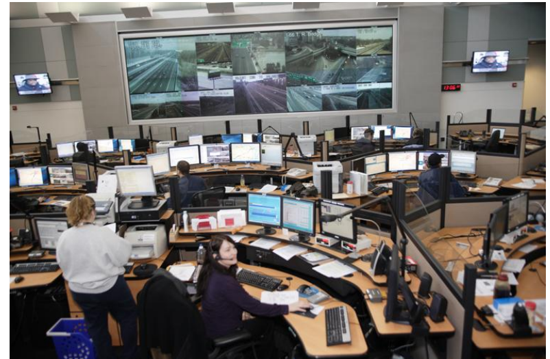
Transportation Operations Center, Northern Virginia (Fairfax County)